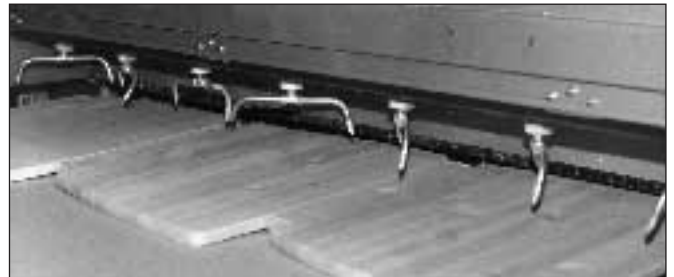
Every wide polishing machine is equipped with 6-9 self-rotating nozzle.

Silvent's SELF-ROTATING NOZZLE has been developed to provide efficient and even blow-off of large areas. For example, wide polishing machines used in the wood working industry make use of rotating nozzles to achieve even and efficient blow-off of the entire wood surface. Conventional open pipe blow-off results in spotty blowing that fails to cover the whole surface and, therefore, uneven quality. An integrated dust removal system is normally used in connection with the rotating nozzles in these wide polishing machines, disposing of waste in an efficient and environmentally sound manner. As the nozzles rotate at high speed and force, the accompanying safety instructions must be followed during installation and use. Silvent will gladly supply these safety regulations upon request as well as in conjunction with initial delivery. Patented.