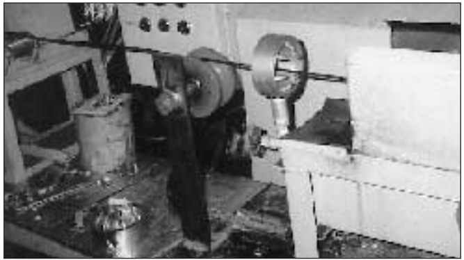
The picture shows a Silvent 456 doughnut nozzle drying cable in continuous production.

The Silvent 456 is a doughnut nozzle for effective drying or cleaning of cables, profiles, hoses, etc. Its design allows the material to be continuously fed through the nozzle. Blow-off is accomplished by 6 concentrated air jets that strike the material from all sides as it passes. The nozzle is suitable for cables and profiles of from Ø 5 to 25 mm ( 3/16"-1"). Patented.