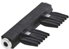
Order no: 304 Z+