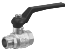
Order no: KVM 12