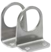
Order no: 3902