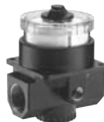
Order no: SR 34